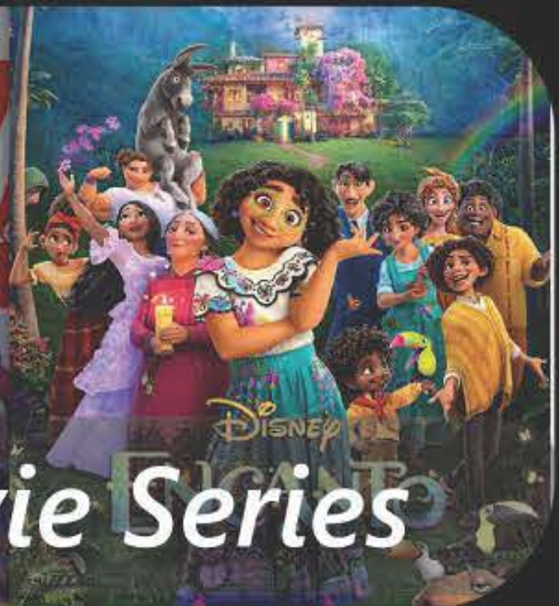
PCTDA Movie Series