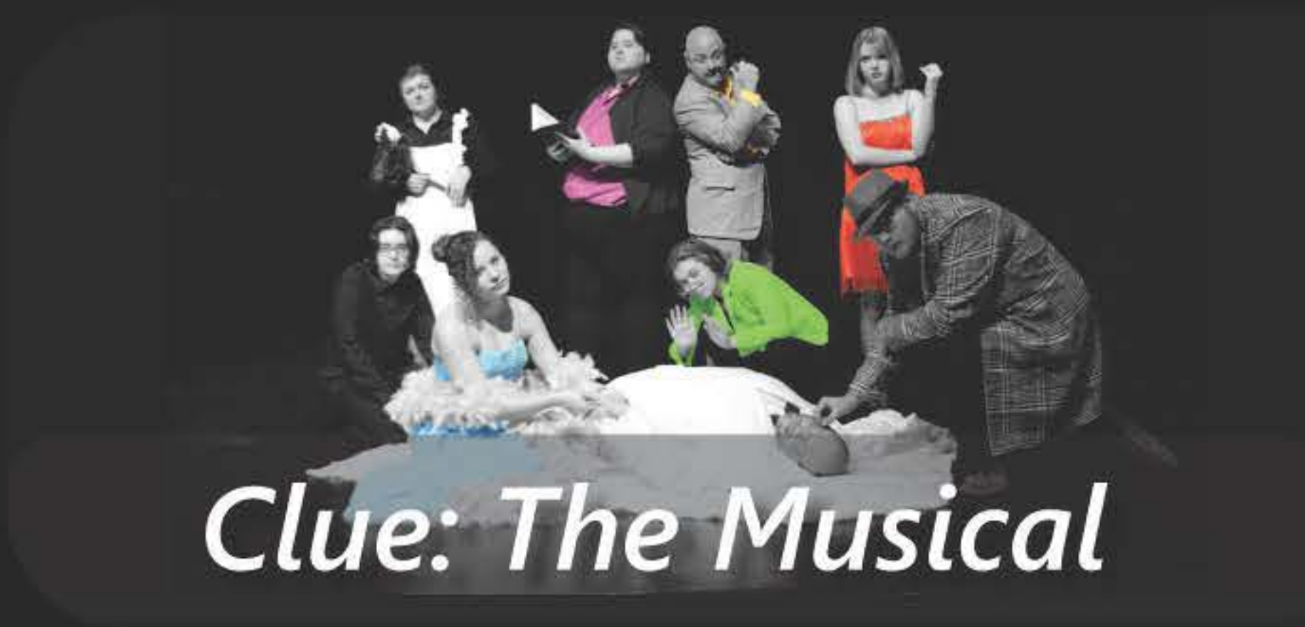
Clue: The Musical