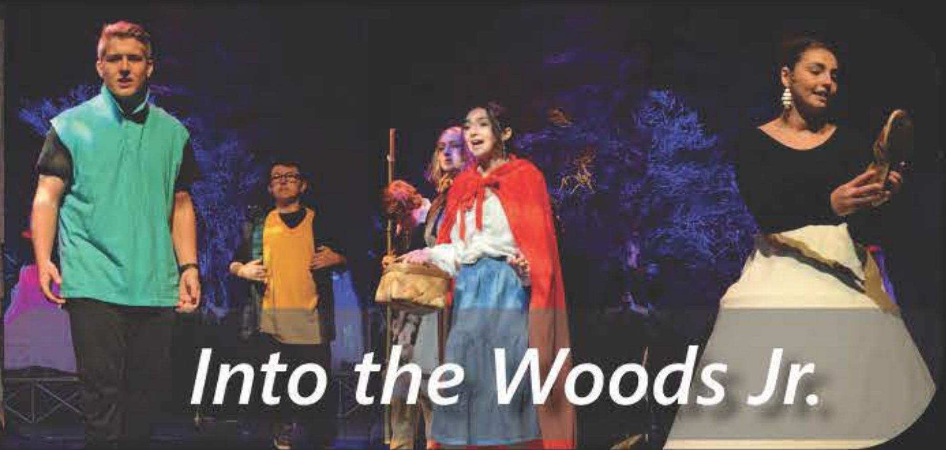
Into the Woods Jr.