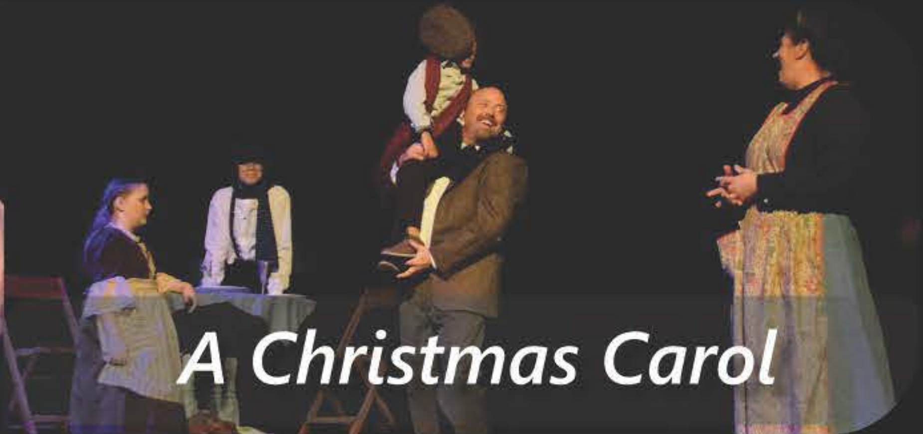
A Christmas Carol