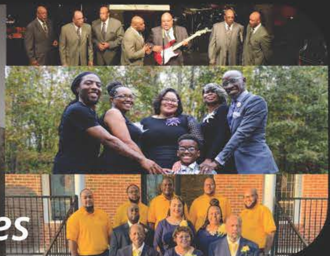
Gospel in Person Series