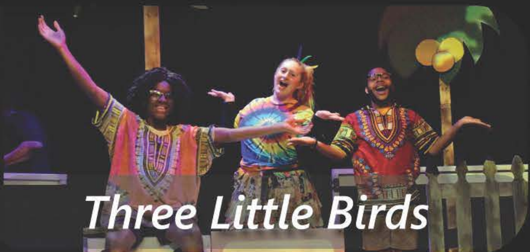
Three Little Birds