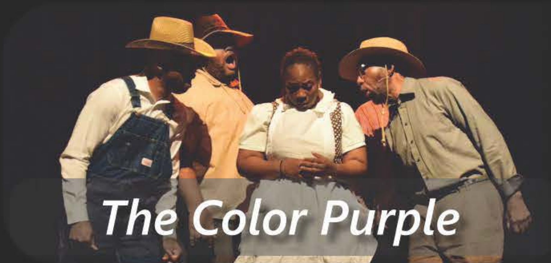
The Color Purple