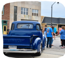
2023 Rox N' Roll Cruise-In in Uptown Roxboro

State tax revenue generated in Person County totaled $2.1 million through state sales and excise taxes (2022)