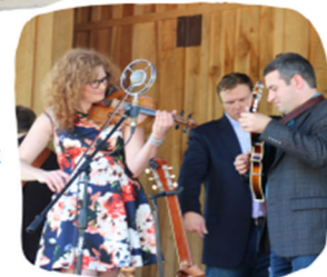
2023 Willow Oak Music Festival